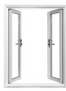
Fully opening French door (hinges on the sides and astragal)